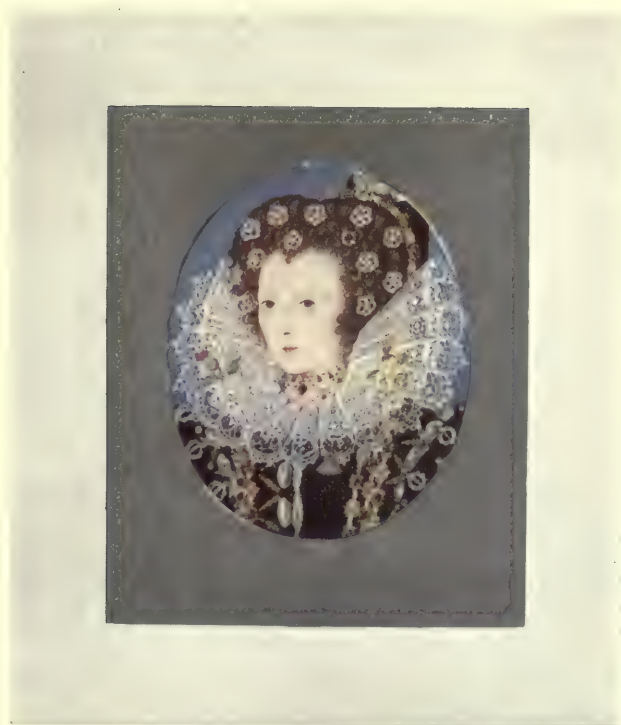
QUEEN ELIZABETH BY NICHOLAS HILLIARD